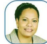
Mhe. Angellah J. Kairuki (Mb) Waziri wa Nchi OR - TAMISEMI