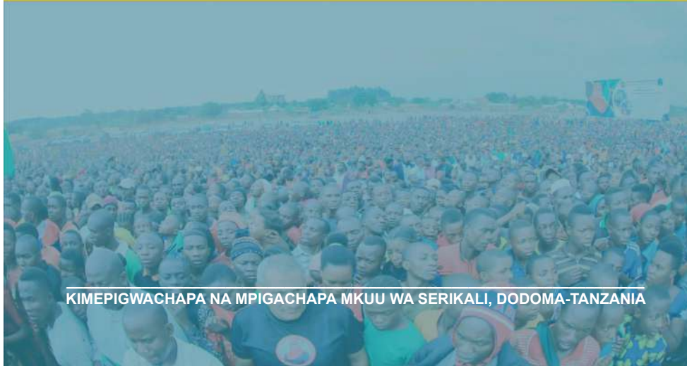
KIMEPIGWACHAPA NA MPIGACHAPA MKUU WA SERIKALI, DODOMA-TANZANIA