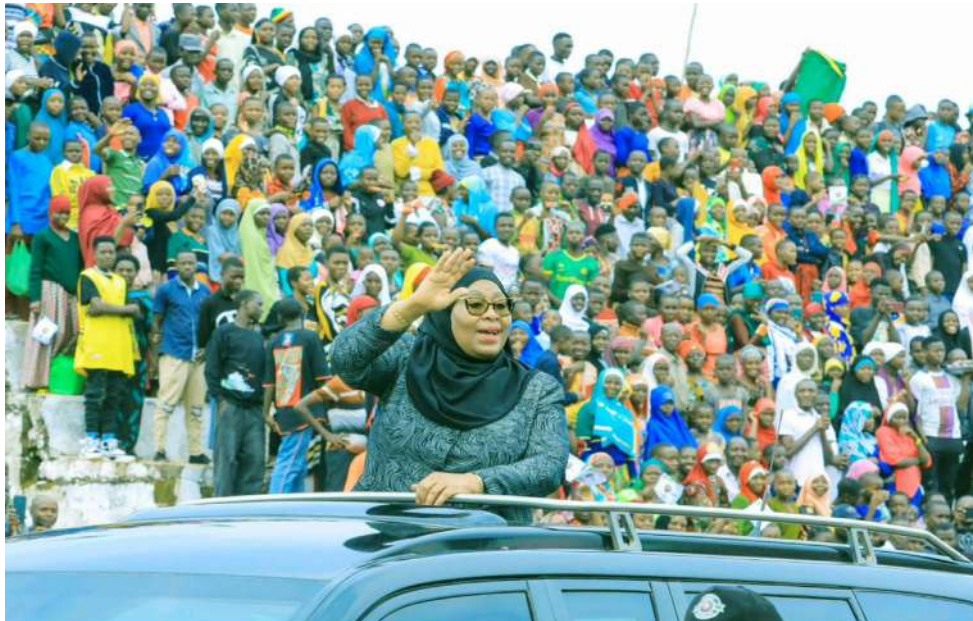
RAIS WA JAMHURI YA MUUNGANO WA TANZANIA, MHE. DKT. SAMIA SULUHU HASSAN AKISALIMIANA NA WANANCHI WA KIGOMA KATIKA UWANJA WA MICHEZO WA LAKE TANGANYIKA WAKATI AKIHITIMISHA ZIARA YAKE YA KIKAZI MKOANI HUMO