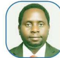
Mhe. Dkt. Festo J. Dugange (Mb) Naibu Waziri OR - TAMISEMI (Afya)